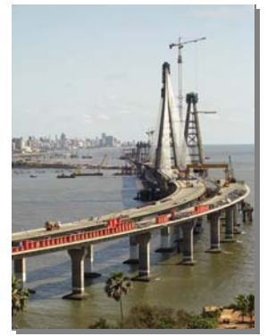
Under construction, May 2008