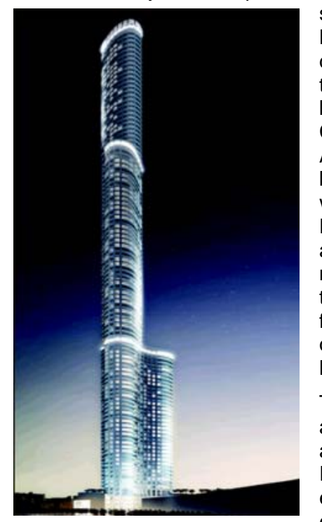
Artists Rendering of World One