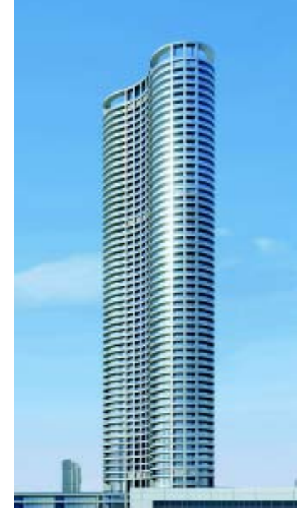
Artists Rendering of World Crest

Cities have typically been marked by iconic structures to symbolize economic progress and Mumbai, the commercial capital of India is no different. World One is the iconic masterpiece of a three residential tower, shopping mall and office building development at the site of the old Srinivas Cotton Mills factory located in Upper Worli, Mumbai. At 442 m and 117 storeys, World One is destined to become the second tallest residential building in the world, a mere 70 m short of Pentominium Tower in Dubai, slated to be completed in 2013, one year ahead of World One. However, the final height and number of floors will not be made public until closer to the completion of the tower. One of the landmark features of the tower will be the open-to-air observatory '1000' located, at 1000 feet above sea level.